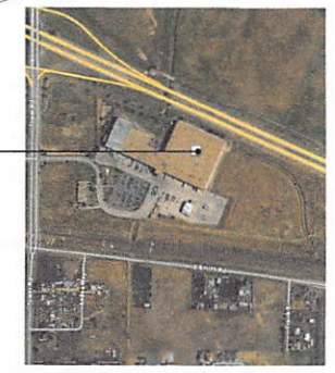
PROXIMITY PLAN AS NOTED ABOVE