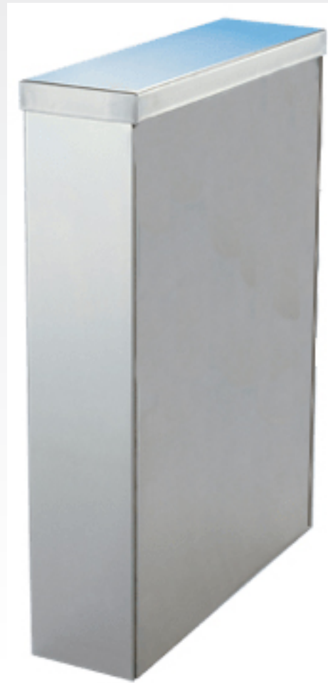
FP500-ADA ADA gate can be motorized

The Stadium FastPass™ Series is made for years of reliable service in high traffic/volume applications like stadiums, convention centers, landmarks and military bases. The cabinets are constructed of heavy 14-gauge, 300 series satin stainless steel and feature our 6500 Series Control Head (with auto indexing and shock suppression technology). Thousands are currently in use at leading pro-sports venues, amusement parks and highprofile attractions worldwide. The Stadium FastPass is the ticket to managing large crowds with reliability and speed.