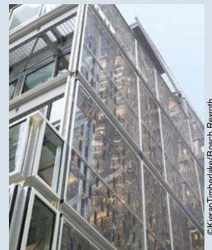
Cellophane House, KieranTimberlake

Rexroth framing served as the structural framework to which other building elements were swiftly attached. Just as the elements were assembled easily, so were they disassembled easily and stored for future redeployment, preserving the energy embodied in the house materials. In an effort to further reduce waste, the dimensions of the house were dictated by the standard measurements of the Rexroth extrusions.