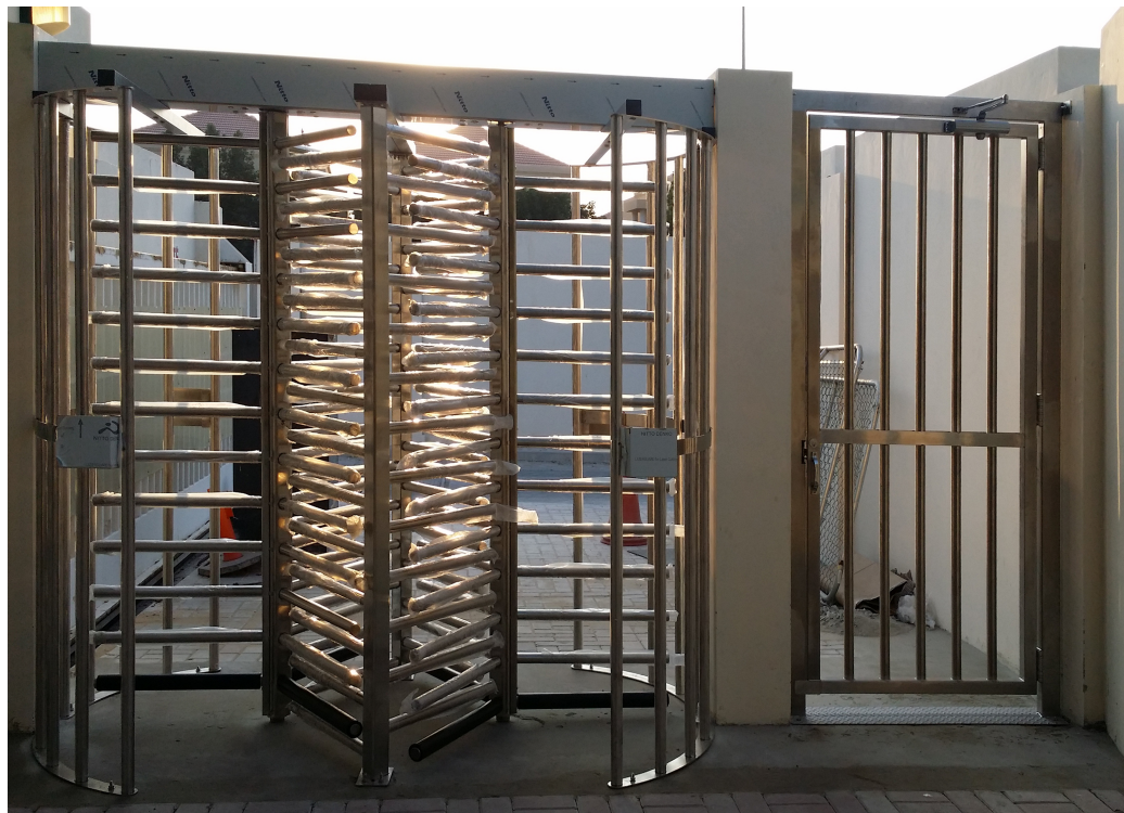
New Installation shown with stainless steel tandem turnstile and HS336 ADA gate.