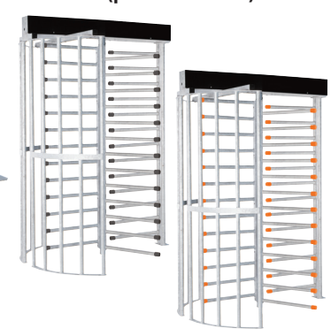
Shown with matching HS336 Full Height Gate

Optional black or safety orange end caps available for galvanized units. (photos below)