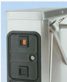
Optional coin box