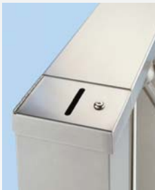
Optional ticket box