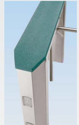
PTZ Trapezoid-end with solid surface top