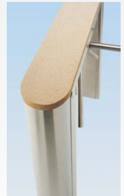
PTR Round-end with solid surface top